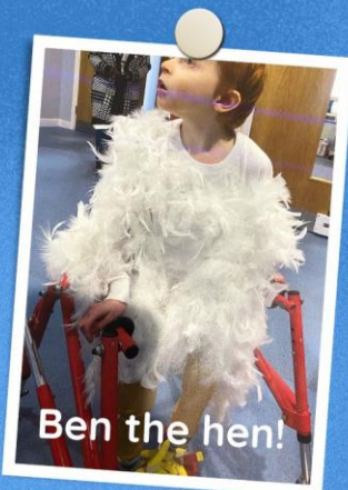
Ben the hen!