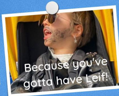
Because you've gotta have Leif!