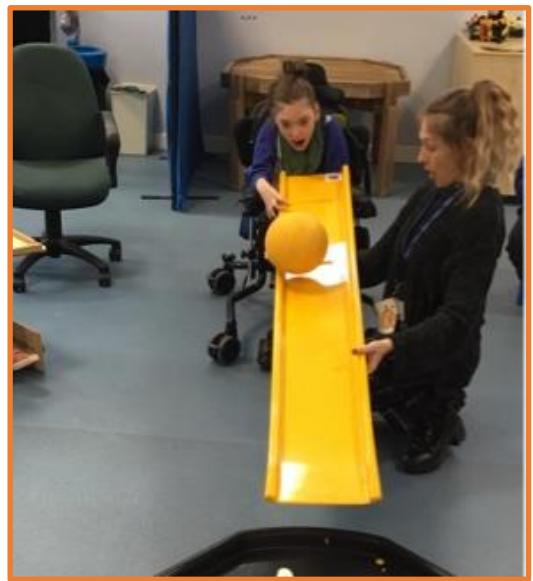
Jupiter class had lots of fun playing Holi inspired games