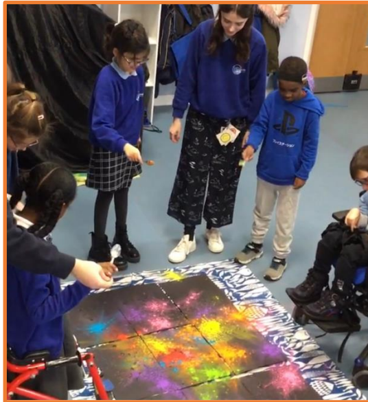
Pluto class threw bright coloured paints to make a beautiful display